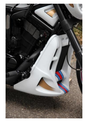
Abb. 1 – Mounted radiator grille

We recommend using a medium-strength screw lock (e.g. LOCTITE 243, blue) for all screws.