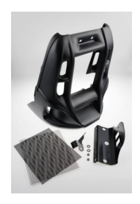
Abb. 2 - radiator grille "Racing"